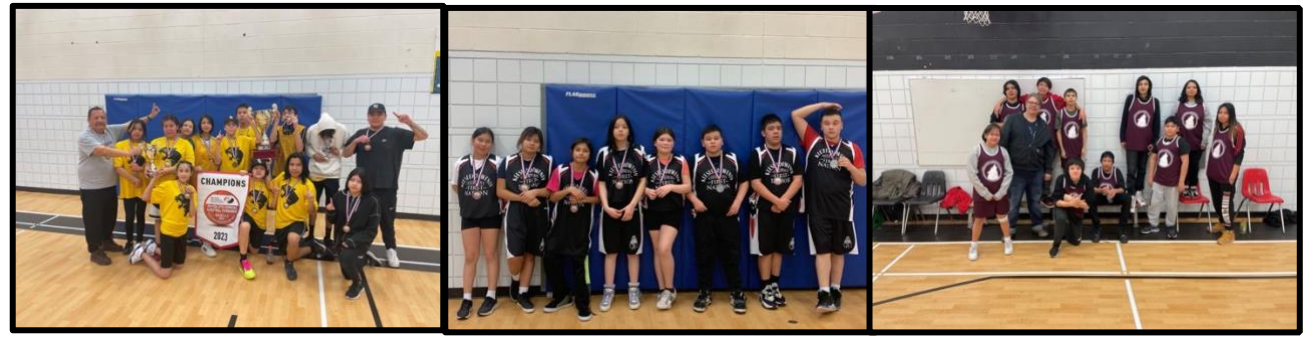
1st: Lake St. Martin First Nation School

Congratulations to everyone that participated on a great tournament!